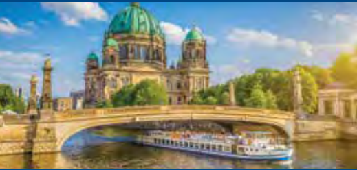
Germany, Czech Republic, Austria, Hungary